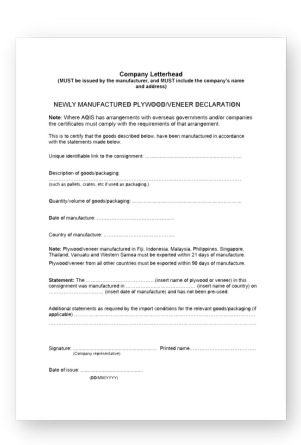
Newly Manufactured Plywood Declaration