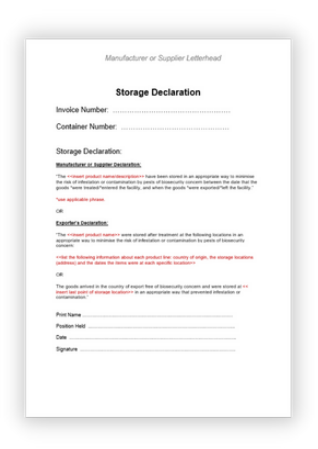
Storage Declaration Sample