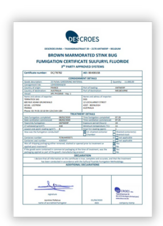
Fumigation Certificare Sample

Furniture imports normally require additional documents and treatment compared to other commodities. In addition to the commercial invoice, packing list, and packing declaration, furniture will also require one or more of the following documents for Quarantine processing. These documents and their requirements are outlined in BICON, as listed on the following page.