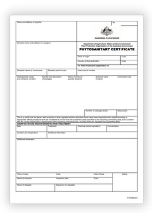
Phytosanitary Certificate Sample